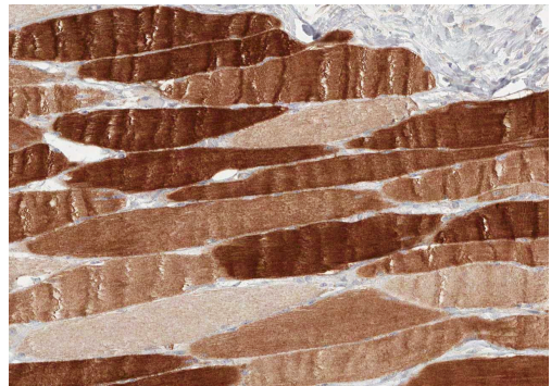
IHC. Skeletal muscle